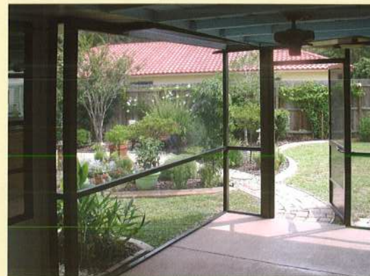
Perfect for patio door screens