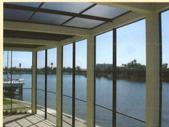
Excellent product for coastal regions

■ BetterVue screen is woven from permanent glass yarn, which has been coated with a protective vinyl to ensure lasting beauty, color and flexibility. It is produced under the most exacting conditions to meet rigid specifications. BetterVue will not rust, corrode or stain, and passed 1200 hours of QUV accelerated weathering.