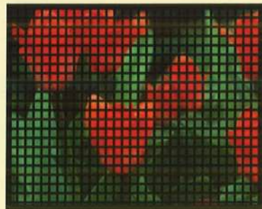
Standard 18x16 Fiberglass